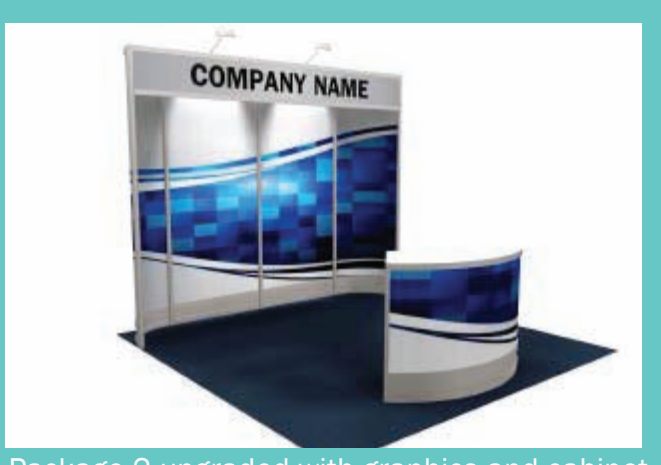
Package 2 upgraded with graphics and cabinet