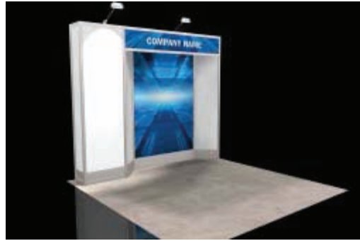
Graphics & Custom Logo